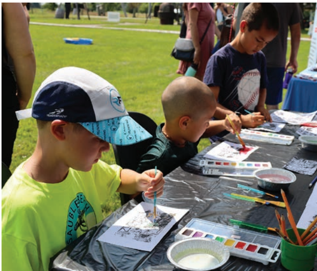
Visitors participate in an art activity at the Oil Museum of Canada's Black Gold Fest.