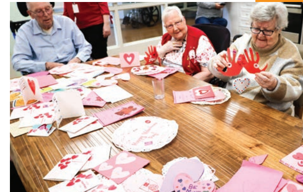
Elders at Lambton Meadowview Villa look at Valentines made for them by library patrons.

Library services saw significant growth in 2024, with 601,785 e-service items accessed by cardholders online, representing about a 14% increase from 2023. Patrons borrowed 545,688 items through in-person service, bringing the total circulation of items to 1,147,473, representing a 9% increase from the previous year. In 2024, the library saw an increase in its active cardholders by 22%, with 25,510 people currently holding active library memberships.