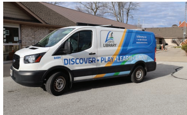
The mobile library van parked in front of Albany Retirement Village in Petrolia where it delivers library service directly to residents.

The Mobile Library brings books and other materials directly to people across Lambton County who might find it hard to visit our buildings. In 2024, our Mobile Library made 192 visits to participating long-term care homes and retirement complexes throughout the county, serving 1,638 people. This service helps ensure more people in our community can access library materials, regardless of their ability to visit our locations.