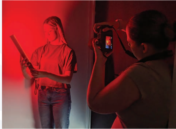
Teens play with light and photography at the Judith & Norman Alix Art Gallery as practice for the Teen Photo Contest.