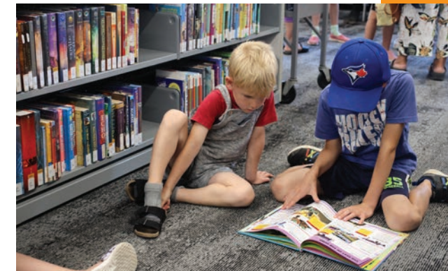
Young patrons browse through a picture book at Clearwater Library.