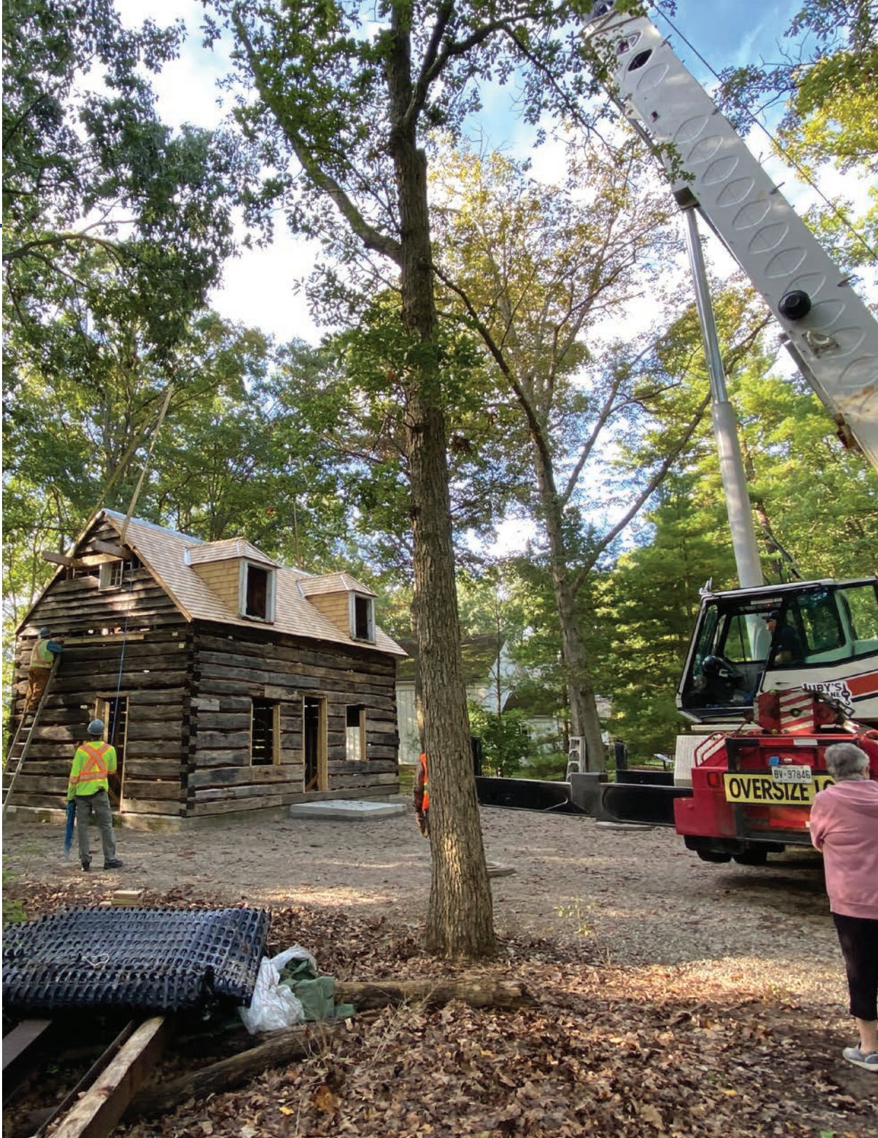
The restored roof is lowered onto Canatara Cabin at Lambton Heritage Museum.