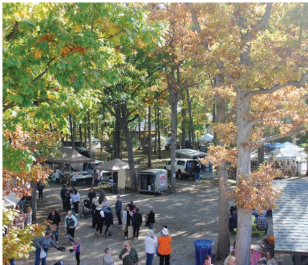
Visitors shop beneath the fall canopy of oak trees at Lambton Heritage Museum's Fall Colour & Craft Festival.