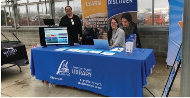
Promoting Lambton County Library at the Sarnia Lambton Chamber of Commerce's Business Showcase.