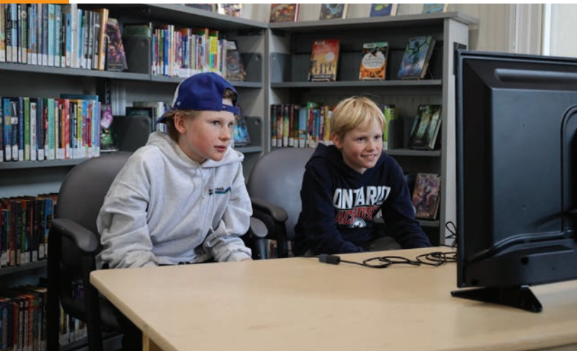
Patrons play retro video games on the Super Nintendo at Petrolia Library.

The Cultural Services Division aims to provide unique experiences that engage and inspire visitors. This is achieved through the presentation of exhibitions and interpretive displays, programs and activities, tours and events, and the use of emergent technologies to enhance the visitor experience.