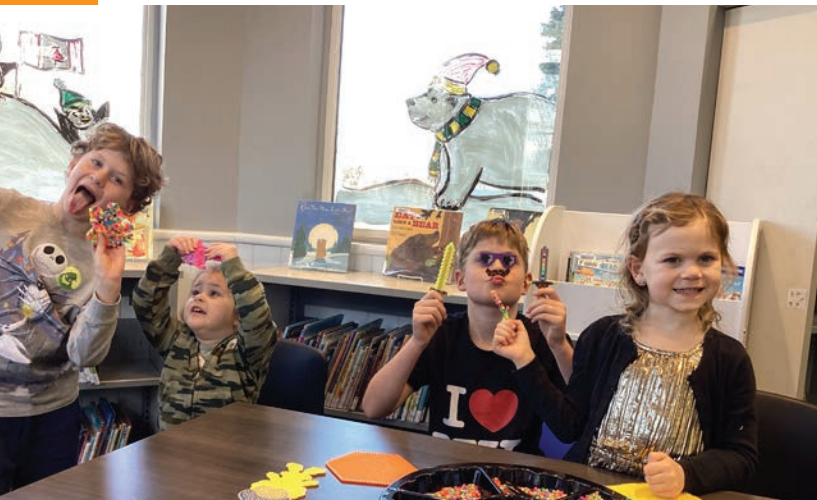
Young patrons create interesting shapes at a Pixel Art program at Forest Library.