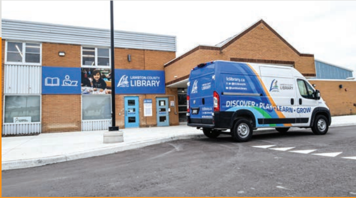
Clearwater Library, 1400 Wellington St., Sarnia