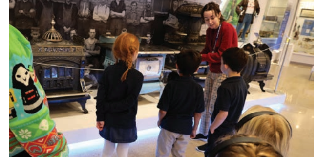
Young visitors explore exhibits at Lambton Heritage Museum.

The Cultural Services Division strives to promote and enhance awareness of cultural opportunities across Lambton County, and provide access to relevant and engaging exhibitions, programming and services for residents at all phases of life.