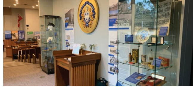
Celebrating Lambton 175 curated by Lambton County Archives and Lambton Heritage Museum on display in Lambton County Council Chambers in Wyoming.