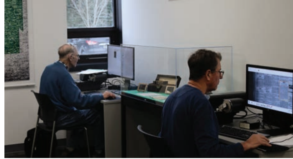
Patrons browsing the microfilm at Lambton County Archives for research.