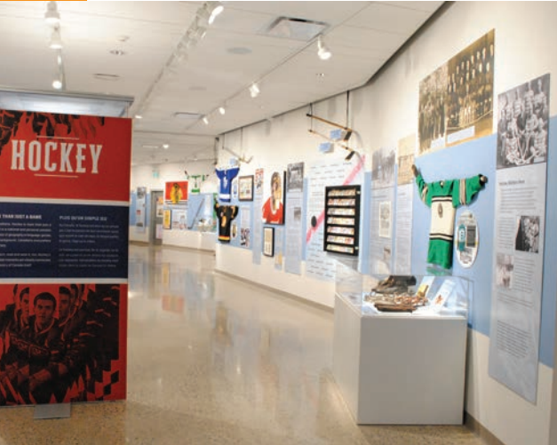
Lambton Heritage Museum's featured Hockey exhibit on loan from the Canadian Museum of History, supplemented by local stories and artifacts curated by Lambton Heritage Museum.