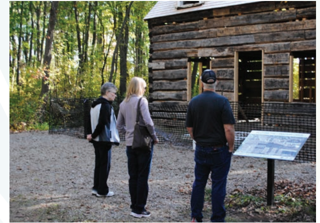
Visitors look at the Canatara Cabin at Lambton Heritage Museum during the reconstruction stage.