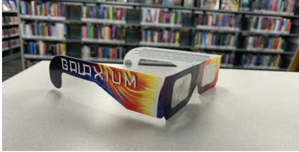
Lambton County Library distributed free eclipse glasses for April's historic solar eclipse, southwestern Ontario's first in the path of totality in 99 years.