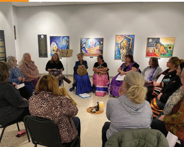
A drum circle ceremony taking place in Lambton Heritage Museum's featured exhibit, S.H.E. is Healing .