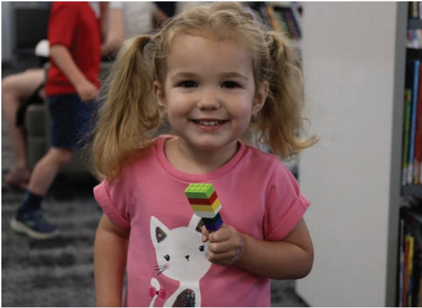
A young patron makes a popsicle out of LEGO at Clearwater Library's Community Open House.