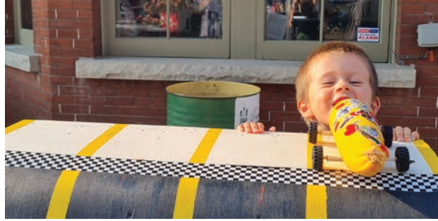
A young patron prepares to race the zucchini car he built at the Petrolia Library as part of One Seed Lambton.